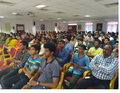
Participants of the Session